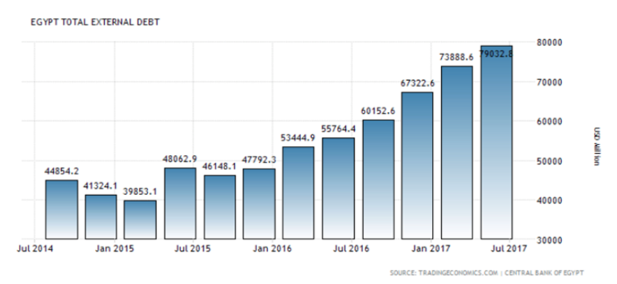
Graph (3) Egypt Total External Debt:<sup>188</sup>

The second aim of the loans is to initiate high-labor infrastructure projects. The loans should be invested in building airports, railroads, solar energy projects, schools, universities, and hospitals. This type of investment will not only raise the level of infrastructure in Egypt to accommodate an extra couple of million of Syrians, but will also provide many direct and indirect job opportunities for newcomers. In 2016, the solar energy industry in the US successfully employed more than 250,000 workers. Investing in the solar energy sector in Egypt could accommodate similar numbers. There is high potential in Egypt to invest in this sector, as solar power in Egypt is available all year round. Emulating Frankfurt airport in Egypt as a transit station to connect Europe to Africa will provide at least 20,000 direct jobs. This number could lead to 80,000 indirect jobs.